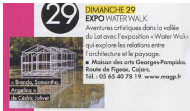
ELLE, 27 August 2010