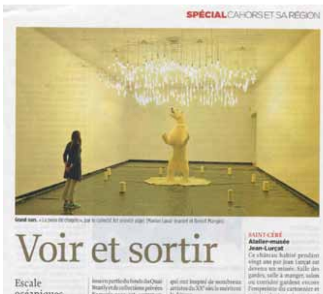
LE POINT, Thursday 20 August 2009