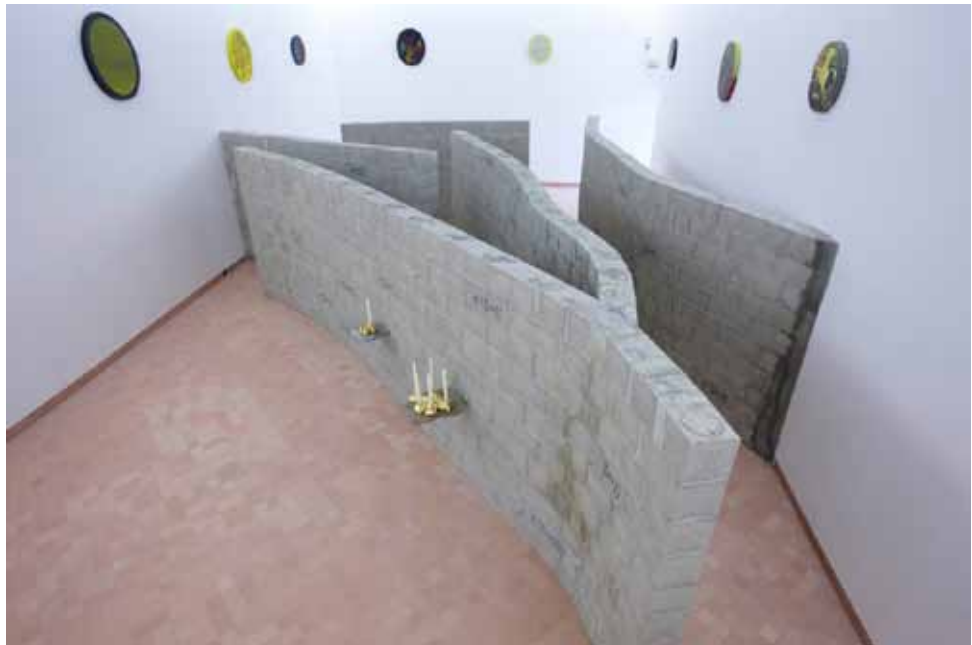
Palm, Small hand and hand and Paintings seen from room 3 of the exhibition AXIOMA, 2009, Courtest of the artist. Photo Nelly Blaya