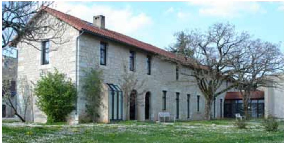
The centre for contemporary art in Cajarc.

The mission of the Centre d'art contemporain Georges Pompidou is to familiarise the public with the best of what France and the international scene have to offer by way of contemporary work by creative artists, both emerging and established.