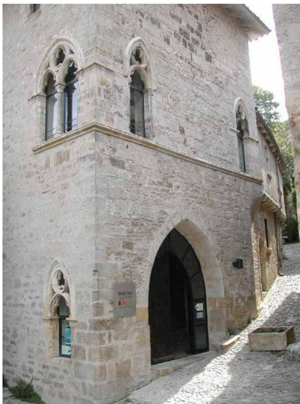
The Maisons Daura in Saint-Cirq-Lapopie