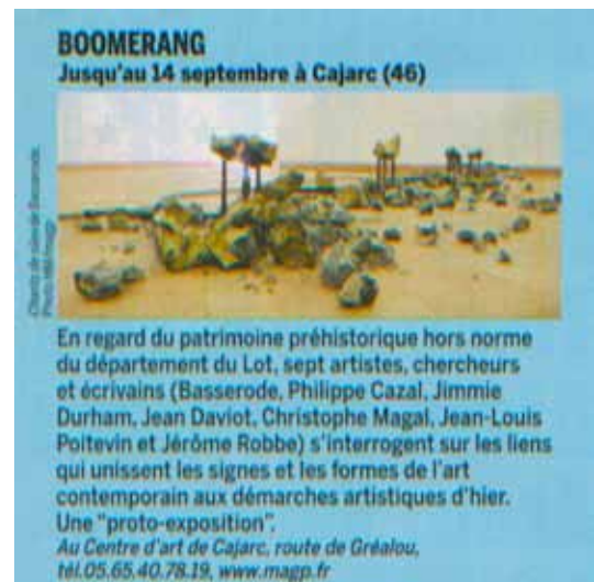
LES INROCKUPTIBLES, 26 August to 1 September 2008